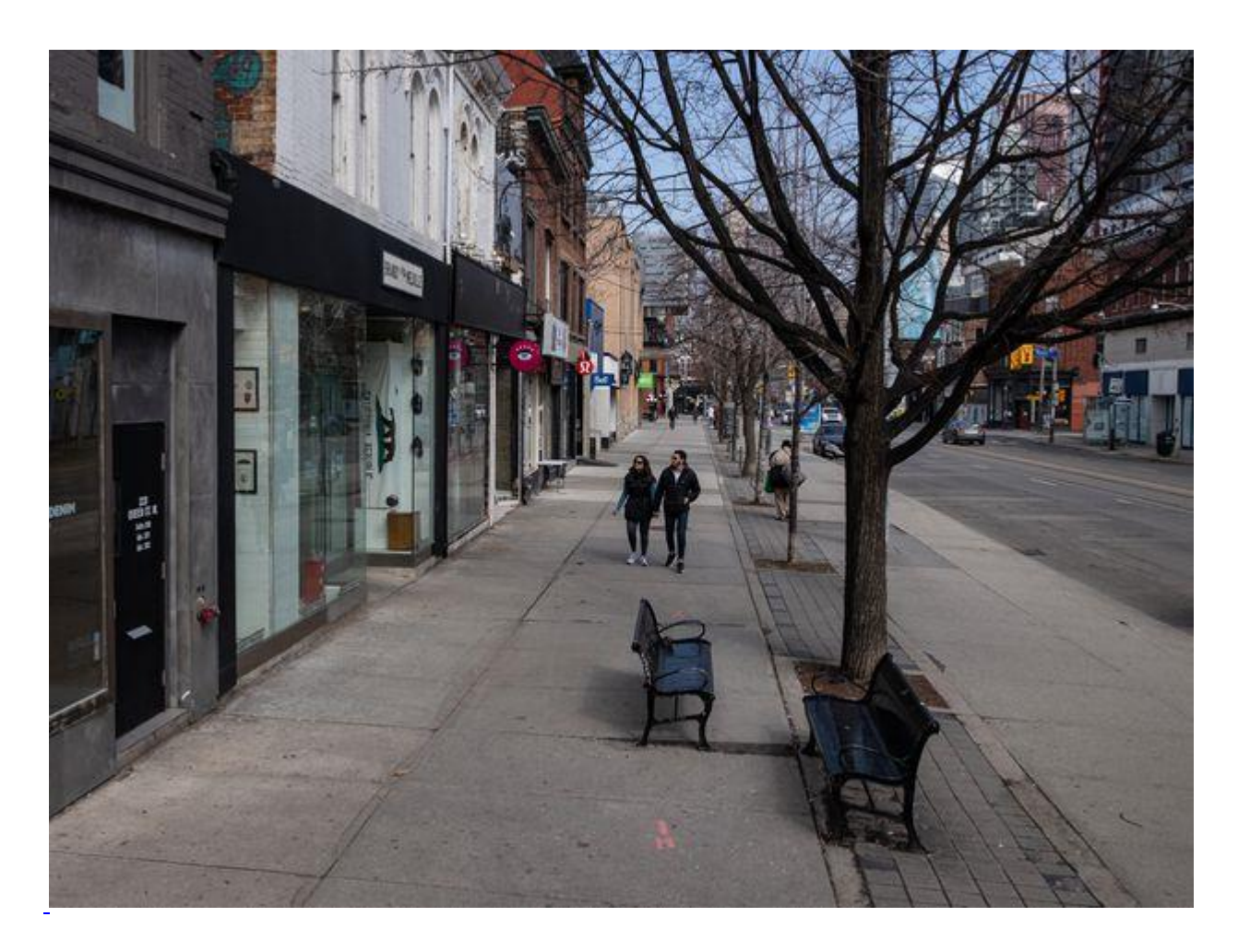
Pedestrians walk along a near-empty Queen Street West in Toronto on March 25, 2020.